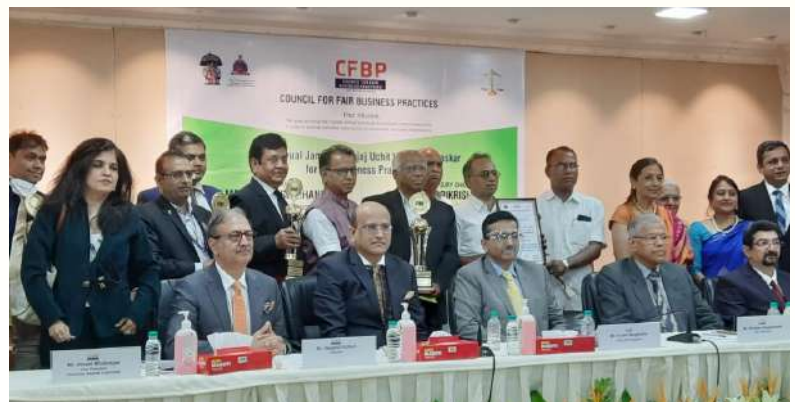
All winners at CFBP award ceremony.