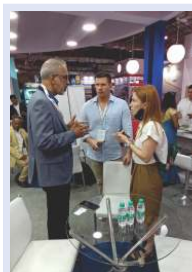
Visitor's interaction with our team

It was a great experience to interact with clients and business partners in person after a big gap.