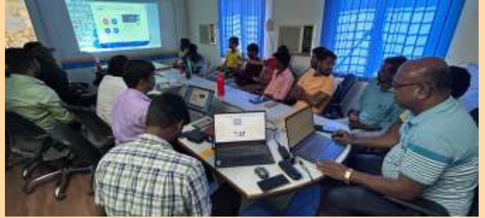
Regional war rooms & brainstorming sessions