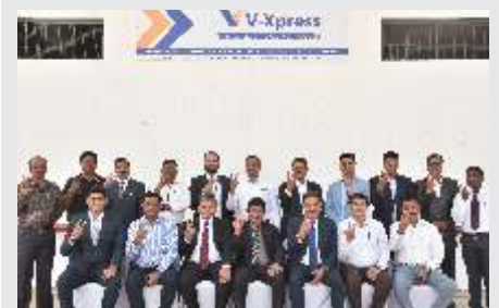
The Leadership team