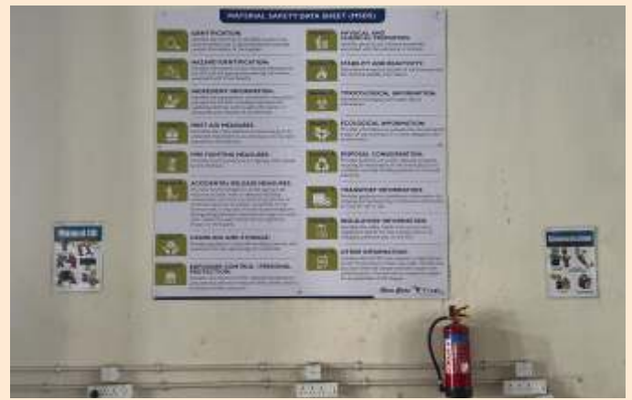
Material Safety Data Sheet (MSDS) info board