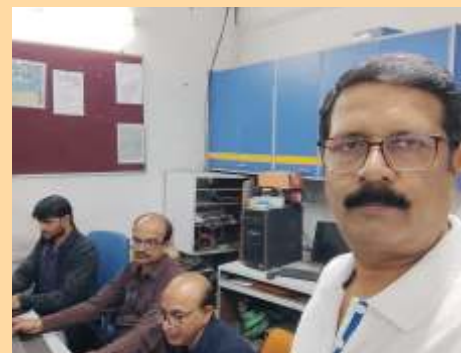
Regional war rooms & brainstorming sessions