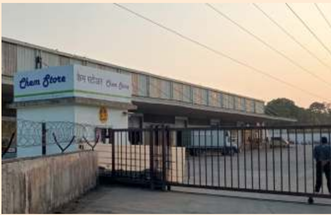
Signs board on the entry gate

ChemStore is our haz-chem storage facility, which is world-class in compliance and safety measures. We recently installed our communication there for the information of visitors and colleagues about various details and compliance that we follow. The branding & communication executed, enhanced the look of ChemStore. See the pics below with banners, posters, and sign boards.