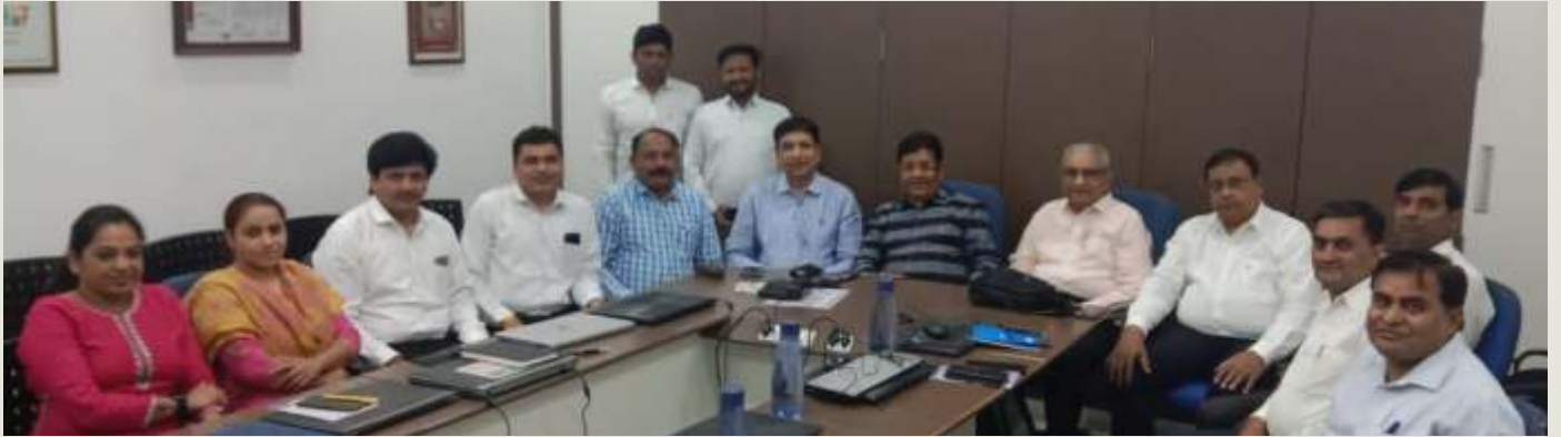
The leadership team. Our 4 senior directors with SGR team during Vapi visit.