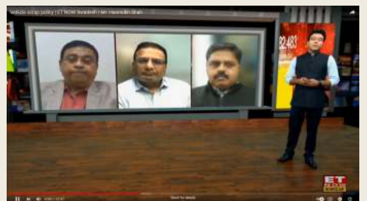
ET Now Swadesh - Episode on Vehicle Scrap Policy