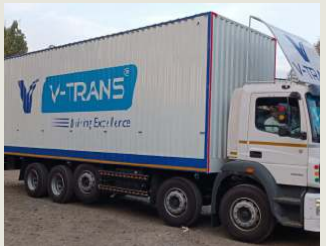
New addition in our Company fleet – 32 Feet High Cube Vehicles