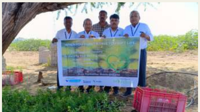
V-Trans colleagues with farmers during tree plantation