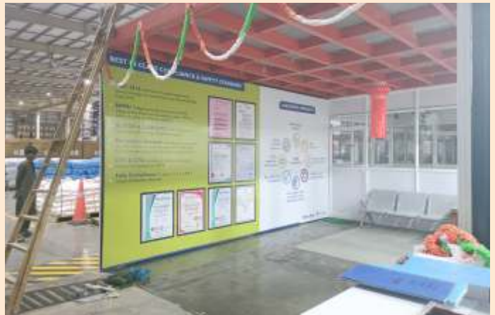
Reception area - Group Strength, Compliance, 6S Lean Workplace.