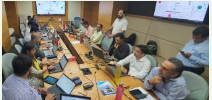
Final leg of preparation at corporate office with partners (Shipex, Deloitte & Oracle)