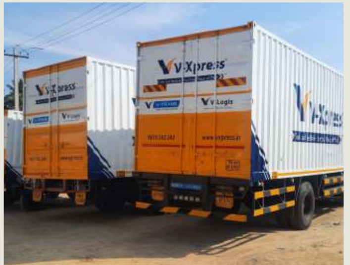
All vehicles of V-Trans & V-Xpress have been standardised with branding