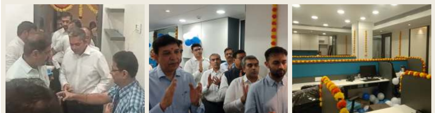
Some glimpse of the new premise and the inauguration ceremony.