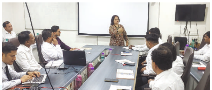
Glimpse of IBM training's - Mumbai Session