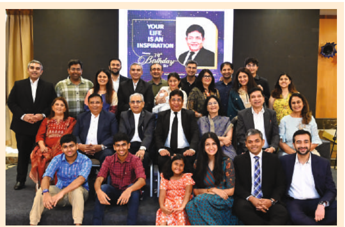
Management team with family members