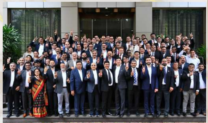
Joyful moments from birthday celebration