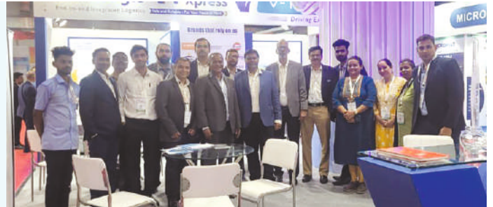
Our Group team at the Stall