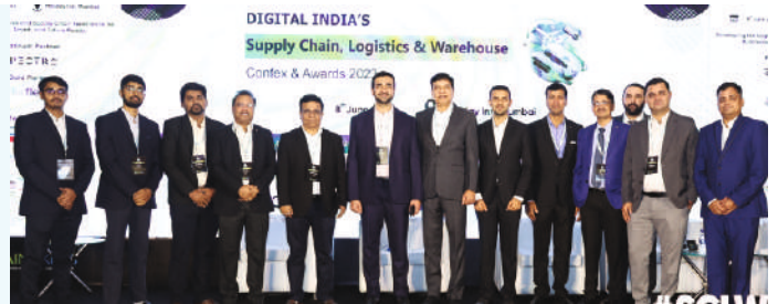
Team V-Logis' with Our Senior Management team