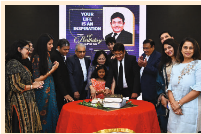
Birthday Cake Cutting

The 3rd generation of the group presented the CMD with a special gift, on his 70th birthday, the group planted 7000 trees on economically deprived farmers land.