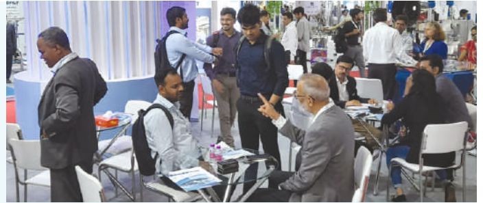
Team interactions with client and visitors.