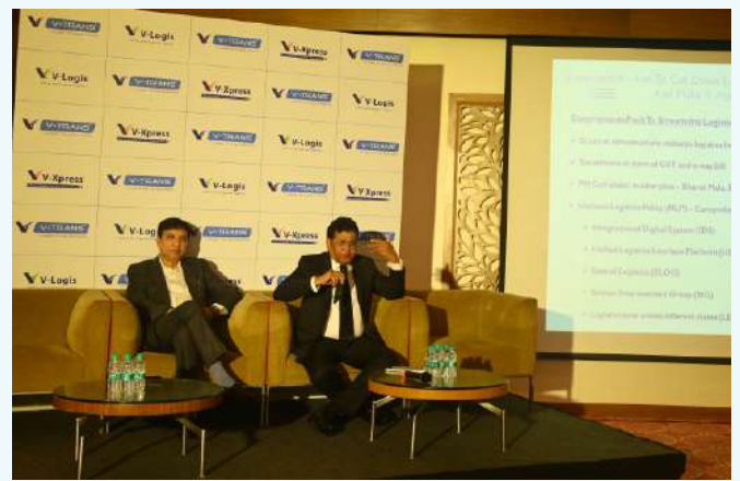
Addressing the press