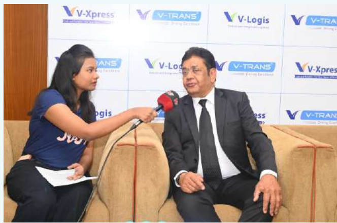
Our CMD while sharing thought on group's South Expansion