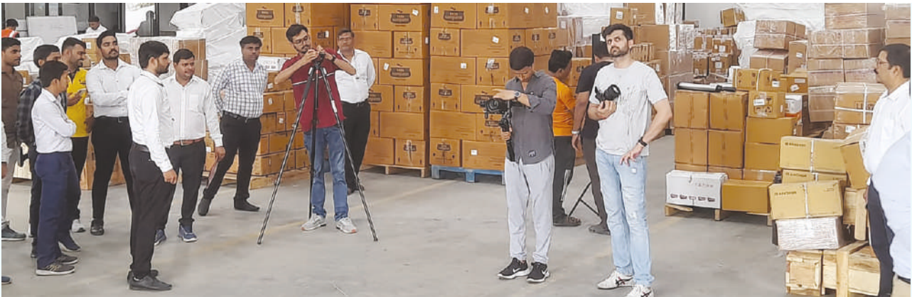
Film production crew at Changodar hub

Multi location shoots, covering the Corporate Office, facilities at Ahmedabad, Bhiwandi etc. were captured. Precisely highlighting the ground operations and how the back end functions support in the overall process.