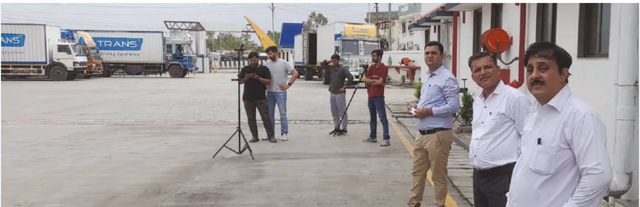
Squad preparing for outdoor shoot .