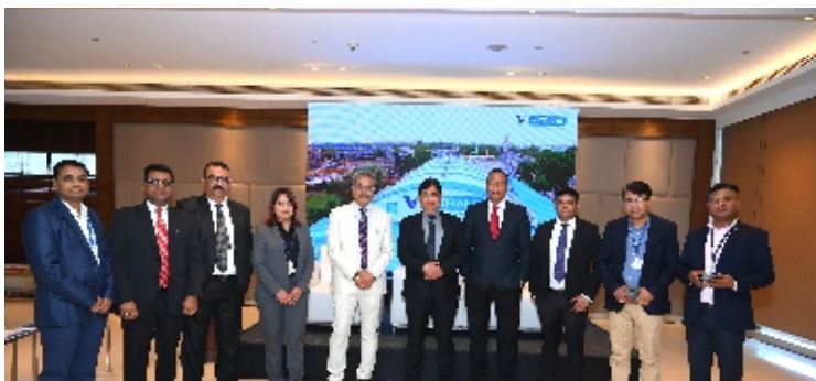
Our Senior Managers at the event

This press meet not only showcased V-Trans' visionary leadership and strategic prowess but also highlighted our commitment to sustainable growth and transformative technology adoption. It garnered significant attention from media and industry experts, reaffirming V-Trans' position as a leader committed to shaping the future of logistics in India.