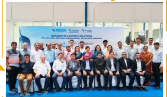
Our Senior management with their families and friends.