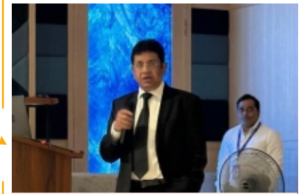
Our CMD's address to colleagues

The quarterly ECM presented a great opportunity to engage with the leadership team and to listen to all our senior leaders from management, corporate team as well as from the regions.