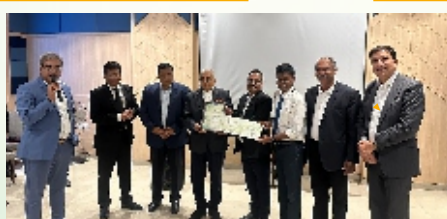
1 st place winner - Team Coimbatore