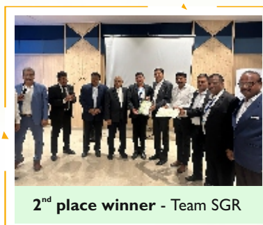
2 nd place winner - Team SGR