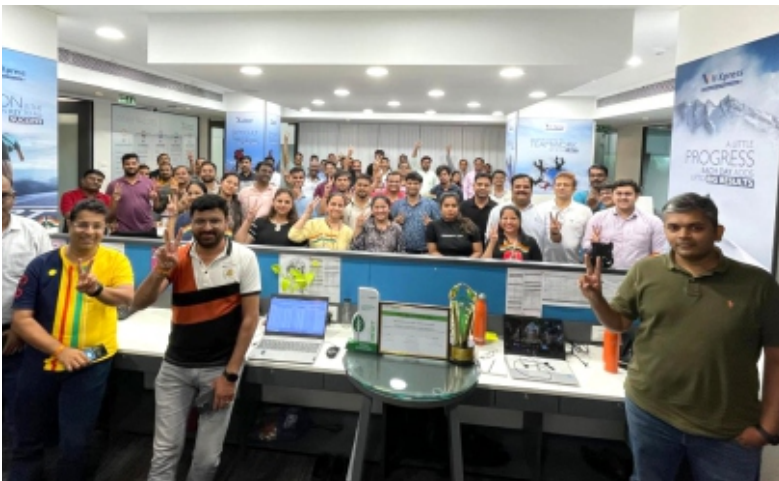
Corporate HO VX team celebrating after receiving the awards