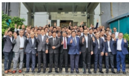
Our Group Leadership Team with V-Trans senior management

During the 2 days of the meeting, each one understood the direction set by the management and aligned the key priorities. With strong people focus and the advantage of best-in-class infrastructure technology, our team is confident to transform and surpass the expectations of the organization as well as of the customers, by providing excellent services.