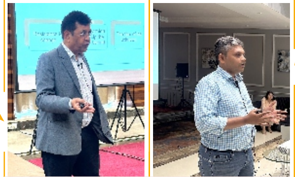
Our Directors, while addressing the team

In conclusion, these cultural workshops have proven to be a vital step in promoting understanding and collaboration, reinforcing our commitment to a diverse and inclusive workplace.