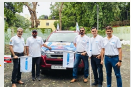
V-Trans senior team at the Flag-off ceremony for the bike rally

As a trusted and reliable logistics brand, V-Trans was proud to partner with Royal Thumps and The Indian Army as the logistics partner for this significant bike rally. Through this collaboration, we aimed to honor the victory of our forces and spread the message of good citizenship to all.