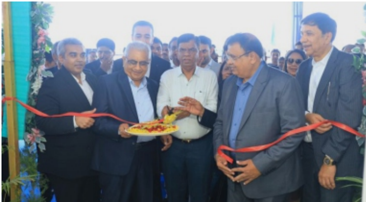
Ribbon-Cutting ceremony with senior management and chief guest