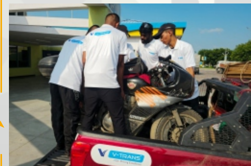
The support vehicle in action helping in moving out of order bike