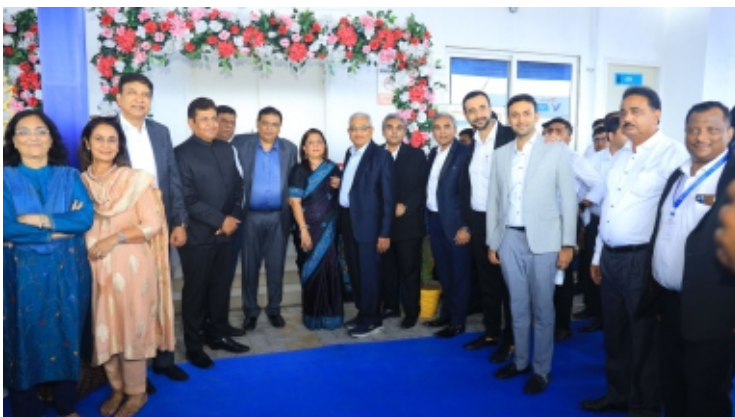
Our directors with their families and colleagues