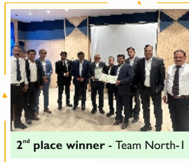
2 nd place winner - Team North-I

Together for Tomorrow is more than just a campaign; it represents our collective commitment to sustainability and a better future for generations to come. By engaging in such meaningful initiatives, we not only contribute to the health of our planet but also inspire others to join us in this vital mission. As we move forward, let us continue to work together, fostering a culture of environmental responsibility and making lasting changes that will benefit our world.