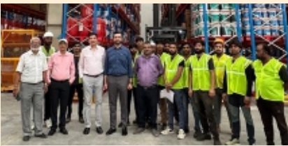
Faridabad (Haryana) Warehouse