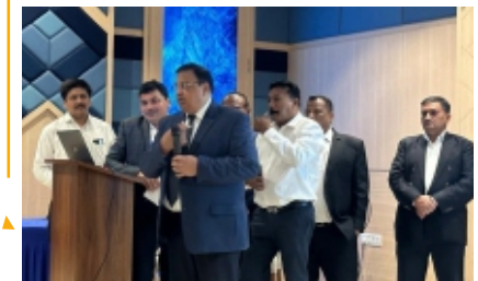
Our Executive Director addressing colleagues with the SGR regional team