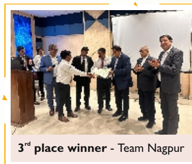
3 rd place winner - Team Nagpur