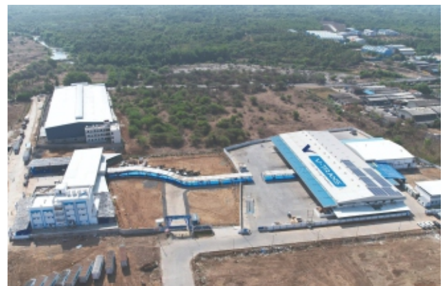
Landscape view of new Pardi transshipment

Strategically located on NH 48, our Pardi hub is designed to be a crucial nerve center for seamless goods movement across the nation. Spread over one lakh square feet, this facility embodies advanced technology and eco-friendly infrastructure, including renewable energy systems. It features best-in-class material storage and handling space, ample parking, and vehicle movement areas, with room for further expansion. The hub also houses regional offices for V-Trans and V-Xpress, spacious warehouses, a fleet division, a mess facility for drivers, and labor restrooms, ensuring optimal efficiency and comfort for our workforce.