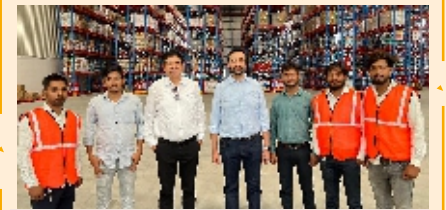
Nandigram (Gujarat) Warehouse