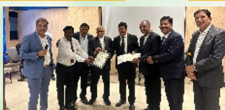
1 st place winner - Team AP-TN