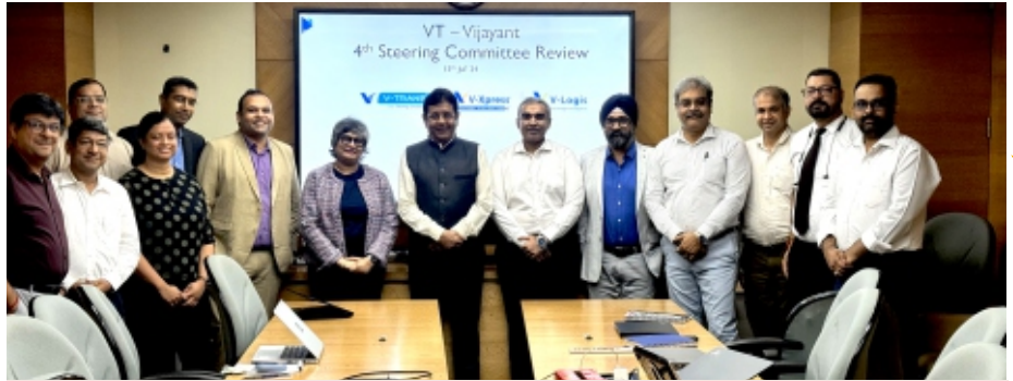
VIJAYANT - Steering Committee: management, senior V-Trans leadership team, and partners from Deloitte team

Here are the key highlights of our new ERP system: