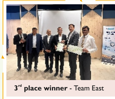
3 rd place winner - Team East