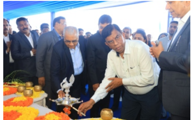
Lamp Lighting ceremony led by our chief guest