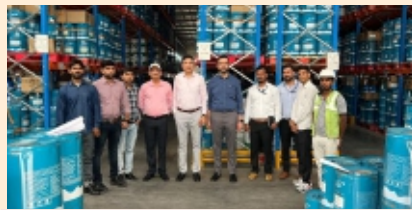
Ghaziabad (UP) Warehouse