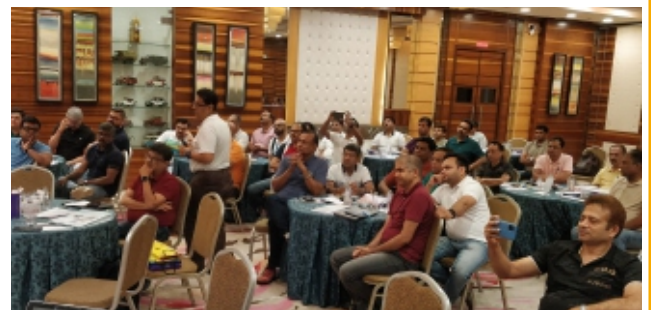
Cultural Transformation workshop across the regions