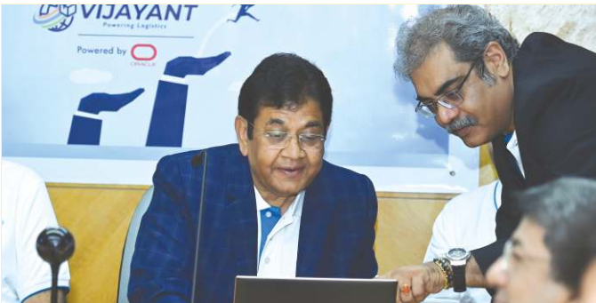
Go-Live: The final click