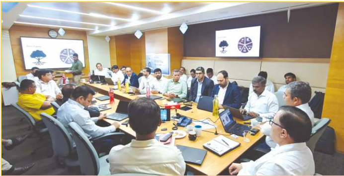
VX AOP meet