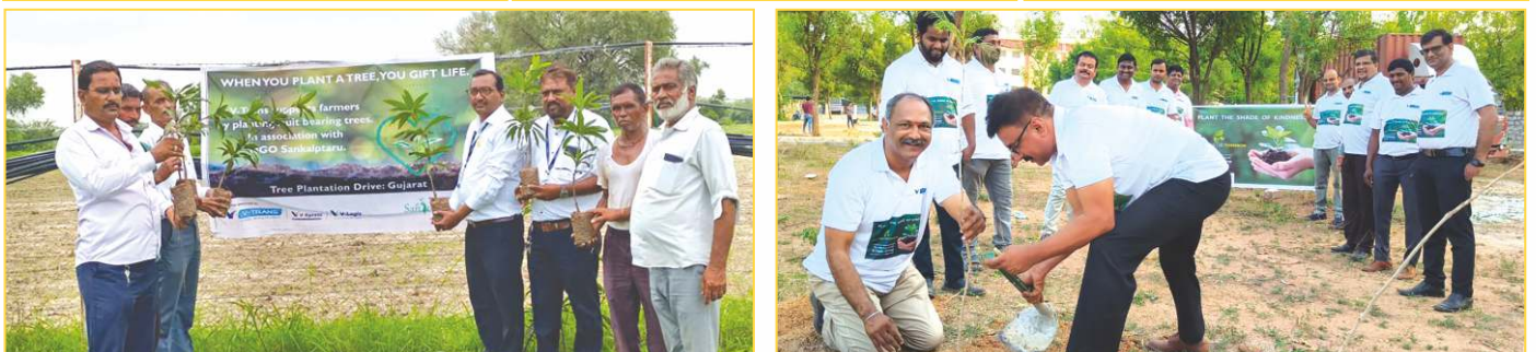
Plantation drive across regions