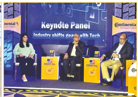
The Leaders of Road Transport Conclave