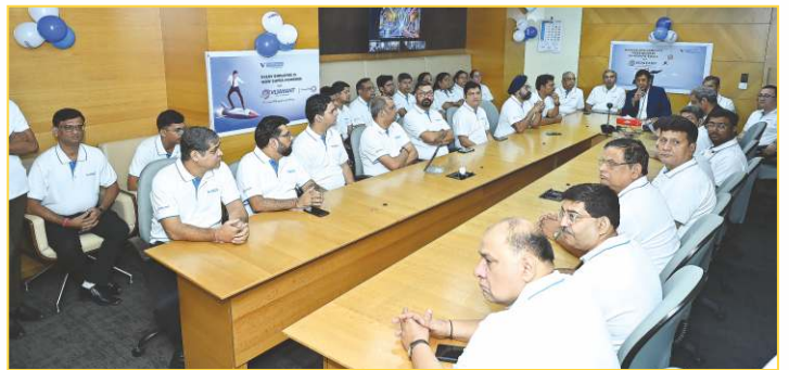
CMD's address post Go-Live session