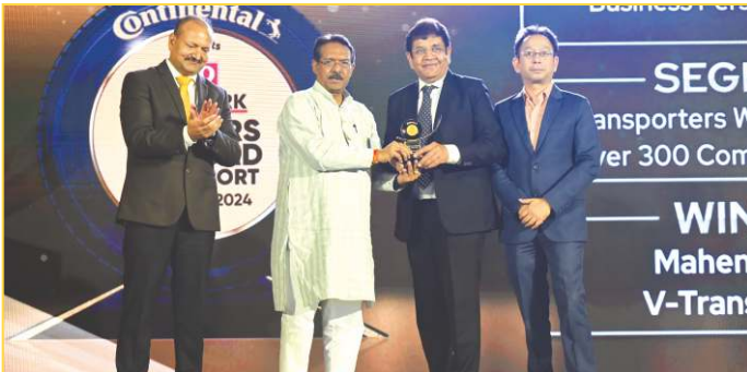
Business Person of the year