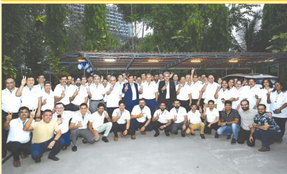
Team together: Group photos