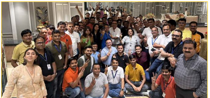
Group pics after the session.