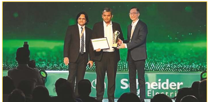
Best responsiveness award to VX 2024 by Schneider Electric