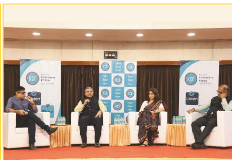
KCF Global Summit