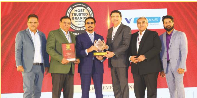
Most Trusted Brand of India 2024