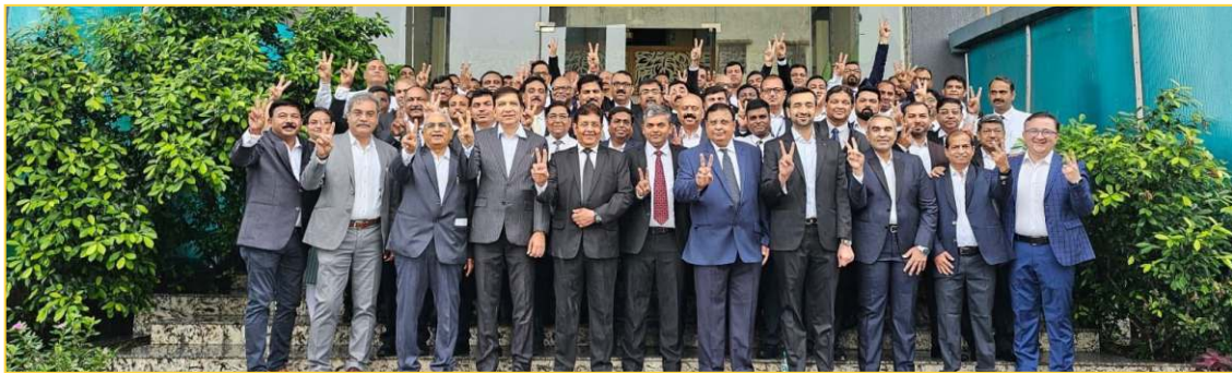
Highlights of quarterly business review meet.