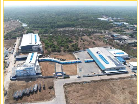
Inauguration event glimpse of State-of-the-art super hub at Pardi