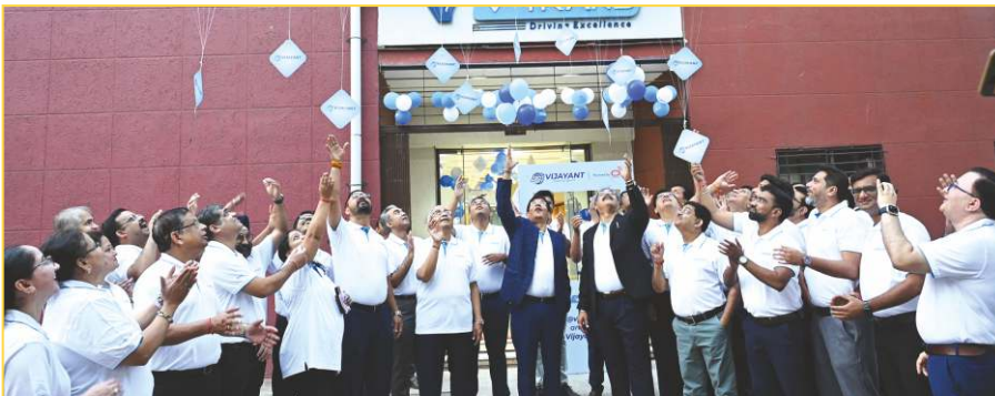
Vijayant Go-Live celebration