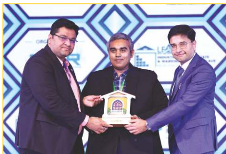
Industrial Real Estate and Warehousing Conclave 2024