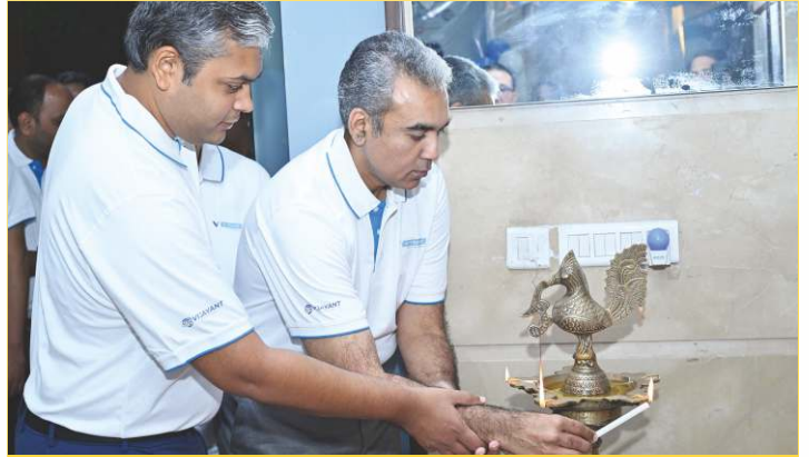
Inaugural lamp lighting