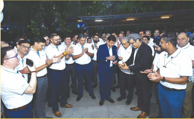
Coconut cracking ceremony

On November 11, we proudly launched our advanced ERP system, Vijayant, after years of dedicated preparation & meticulous planning. This significant milestone was celebrated by senior leadership and colleagues across regional & HO. Together, we marked a transformative leap toward operational excellence and innovation for V-Trans.