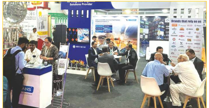
Chemspech exhibition glimpse