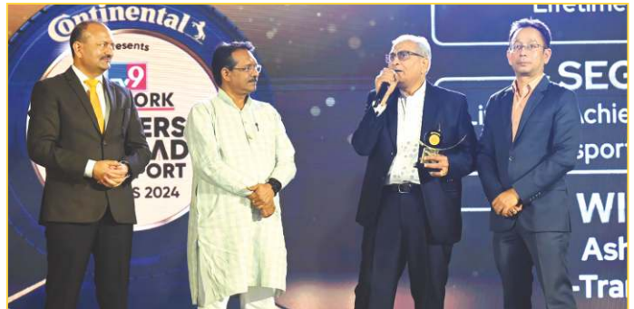
Lifetime Achievement Award 2024, TV09