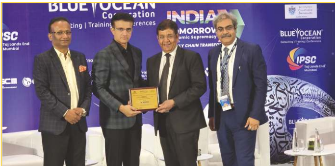
Excellence in logistics award presented by Mr. Sourav Ganguly