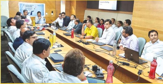
CMD addressing the VX AOP 2025-26 meet

To achieve our ambitious targets, the V-Xpress team, in collaboration with senior management, convened the AOP meeting for 2025-2026. This meeting underscored the significance of proactive preparation and on time execution to ensure our success in meeting the desired goals.