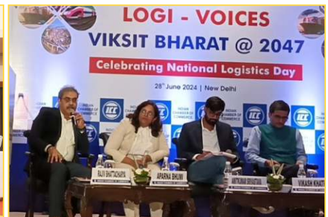
ICC Logic voices Viksit Bharat conclave