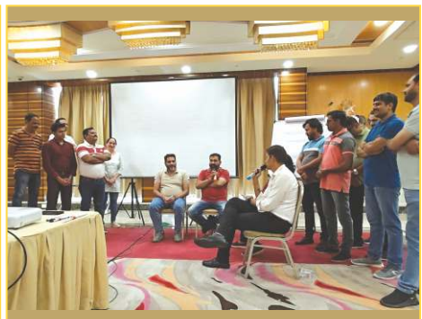
Collaborative workshops and engaging activities