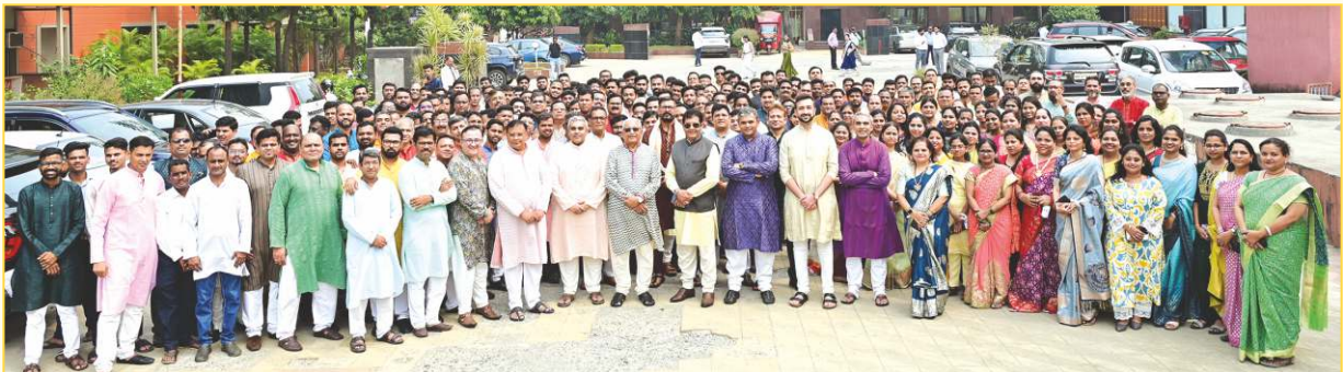
HO team pic with management