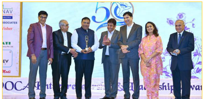
50 th CVOCA Entrepreneurship & Leadership Award 2024