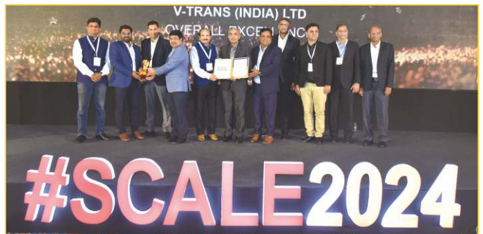
CII - Scale our all excellence award 2024