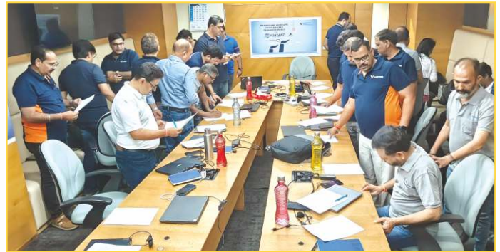
VX AOP- Team building exercise