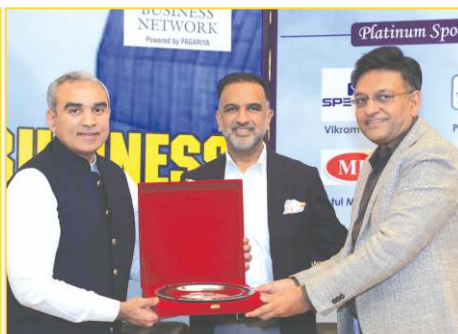
JITO Business Network Summit