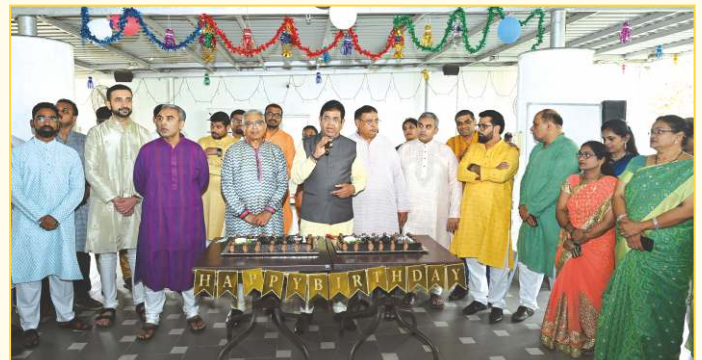
Diwali celebration at Head Office.