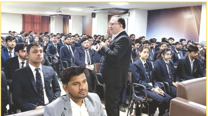
Presentation & Interaction with students during the drive program

Our Senior colleagues visited IIM Jammu, IIM Punjab, Lovely Professional University in Jalandhar, and the School of Management Sciences in Varanasi for campus recruitment, driving V-Trans Group's talent and innovation goals.