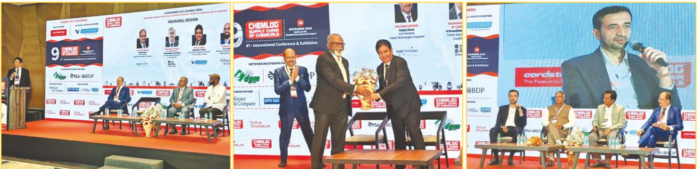
Chemlog event highlight

We partnered with the industry's leading and powerful knowledge-sharing platforms, to enable brainstorming sessions & discussions around logistics challenges & solutions.