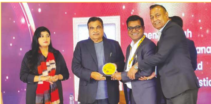
The road raksha : Road safety initiative 2024