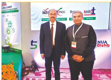
NUA Odisha Global Summit