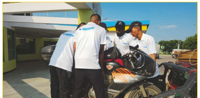
Ground event highlights