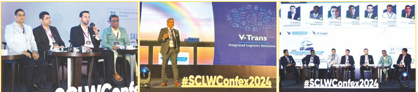
SCLWC, Gain Skill conference glimpse