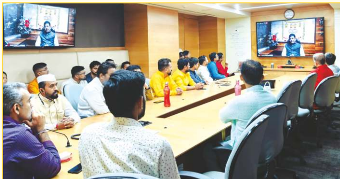
CMD's Diwali address