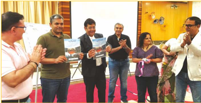
"Upgrid" Book unveiling ceremony with senior management

To support the growth & align the team with fast-track trajectory it was essential to bring a change. The cultural exercise that we initiated in the first quarter, provided the direction to all for this change. Starting with the management & senior leadership team, this exercise was conducted across the country to guide colleagues at all levels.