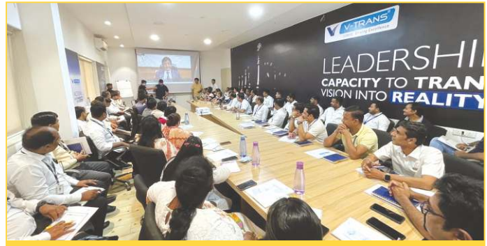
CMD address to the team