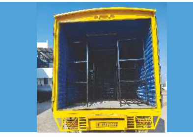
Expert team, customized vehicles for perfect service