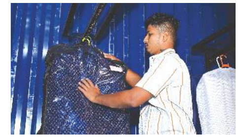
Hanging solutions for Apparels & Dresses such as Sherwani & Lehenga, Chunni & Formal Blazer