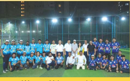
Winner - Male team celebrates their victory at PPL 2025