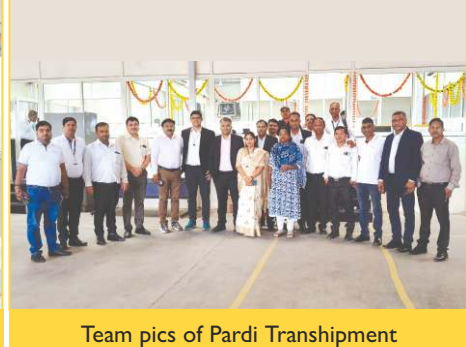
Pooja ceremony at the regional office