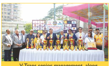
V-Trans senior management, along with special guests on the dais, as the winners are announced.