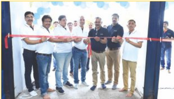
VX Pune Regional Team, along with the esteemed guest at the ribbon-cutting ceremony.