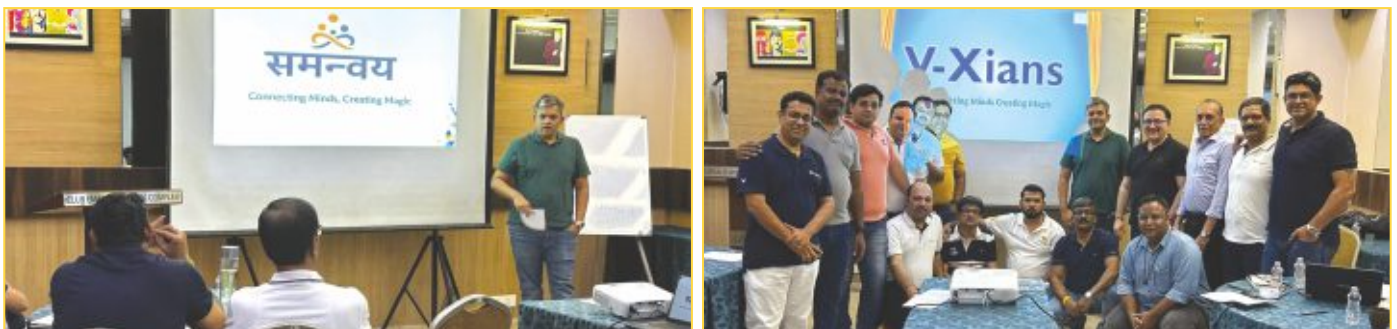
"Moments from the training session"