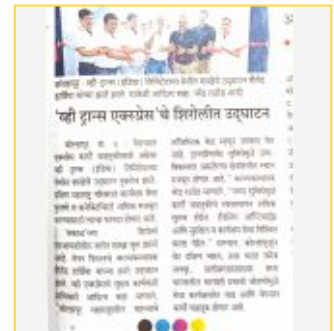
The inauguration received coverage in the Sakal newspaper, marking a proud media presence for the event.

With this move, V-Xpress deepens its footprint in Maharashtra, reinforcing our commitment to redefine express cargo logistics through speed, precision, and performance. The inauguration was also featured in Sakal Media, one of Maharashtra's leading newspapers, underlining the significance of this development for the region's logistics landscape.