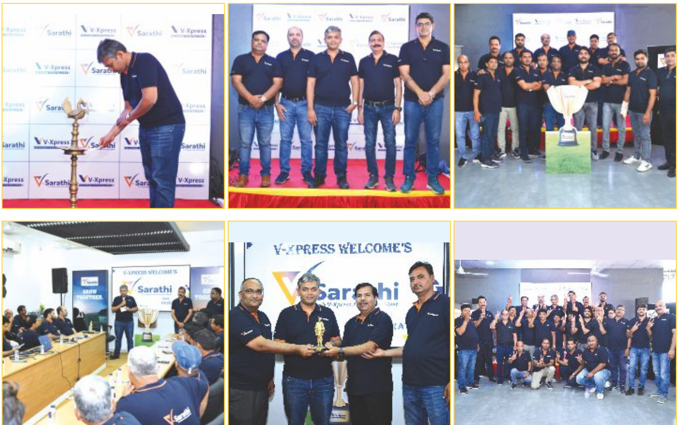
“Some glimpses of the Event”