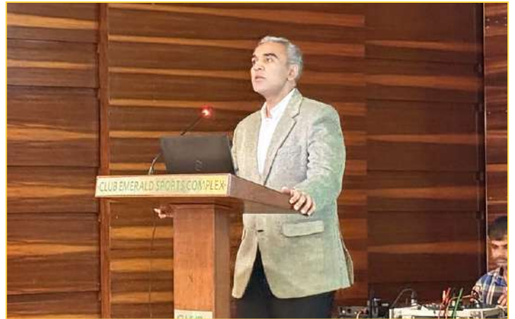
Executive Directors highlight key priorities and milestones