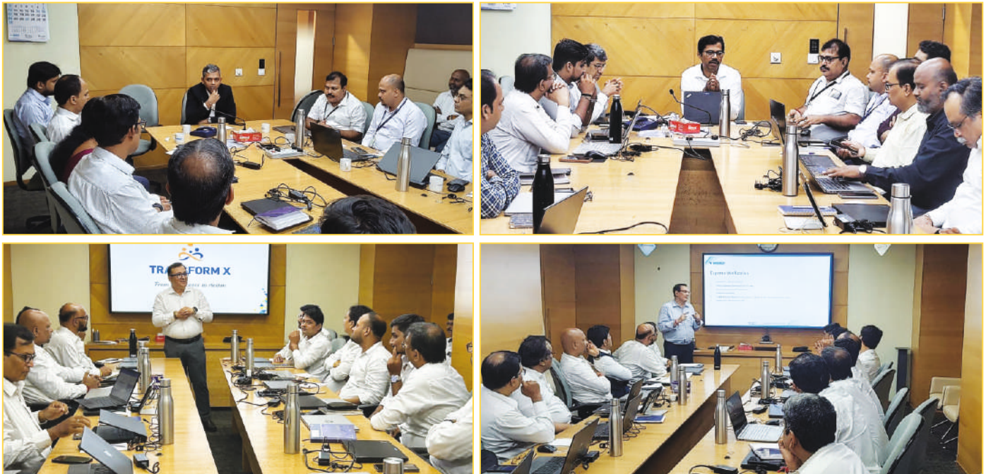
Accounts & Finance Meet 2025 – Insights and Inspiration from Senior Leadership