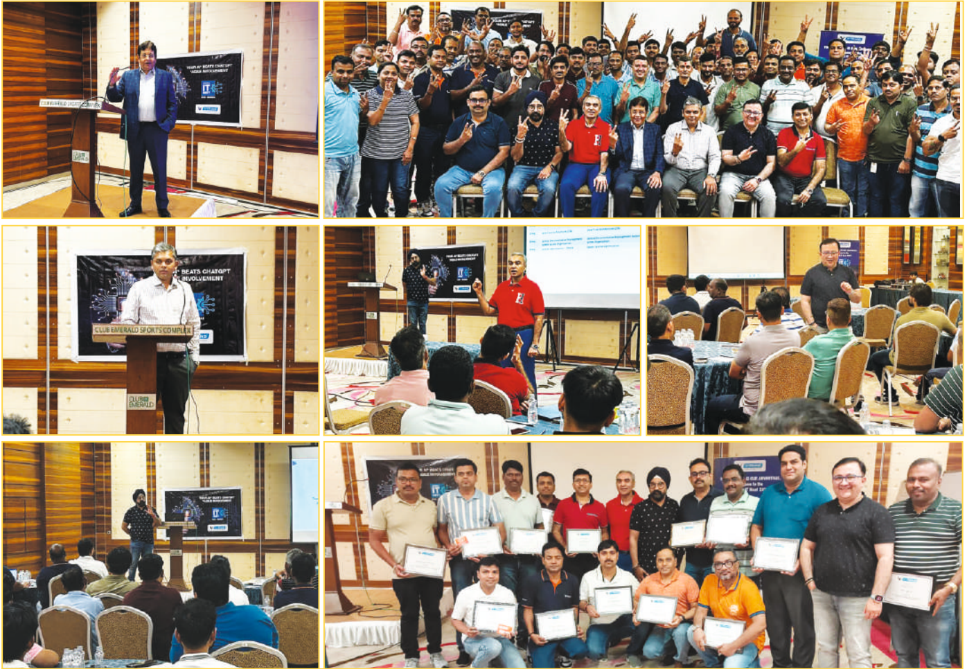
National IT Meet 2025 – Glimpses of Collaboration & Innovation