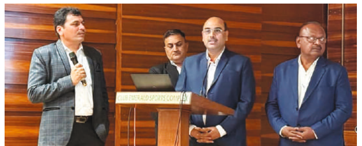
Glimpses from the ECM meet