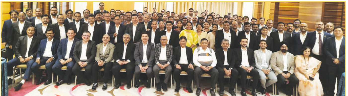
Glimpses from the ECM meet