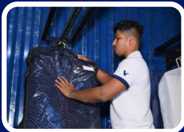
Apparel hanging solutions for ethnic and formal wear