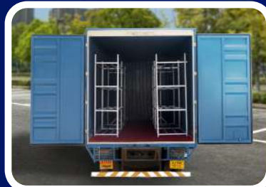
Expert team and customized vehicles for flawless service

Minimize the stress of organizing your destination wedding with V-Trans' end-to-end wedding logistics solutions. We ensure seamless transportation of wedding décor, outfits, furniture, food items, gifts, and event equipment.