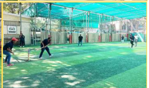
Moments from the V-Xpress Premier League