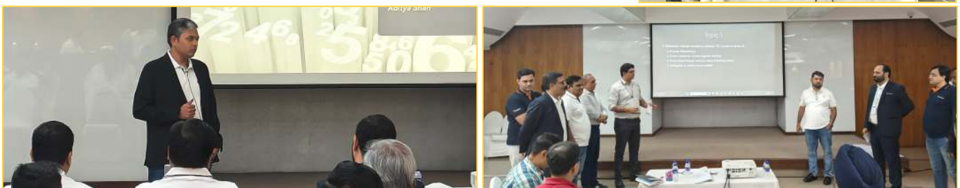
V-Xpress leadership aligning on vision, strategy, and execution to drive the journey forward