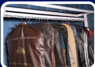
Secure hanging system for garment bags