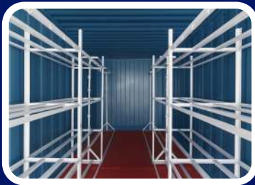
Racking arrangement for suitcases, bags, and other luggage