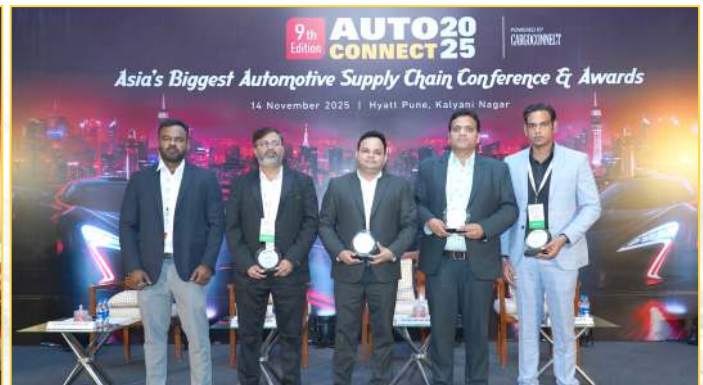
Engaging discussions and insights at Auto Connect 2025