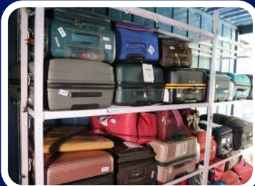
Suitcases and bags neatly organized in the rack system