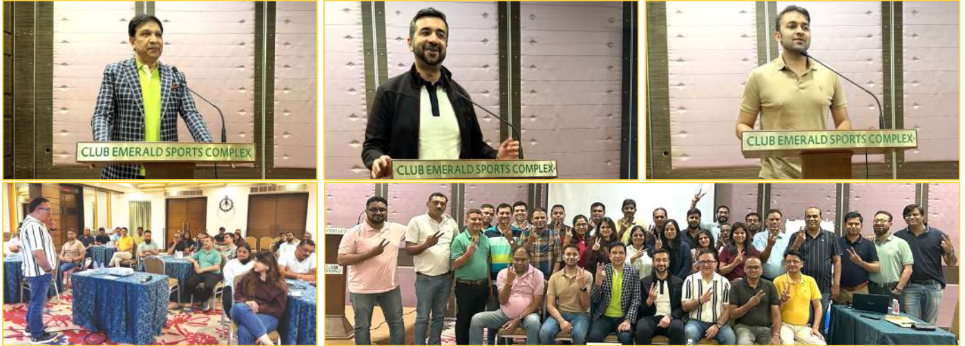
V-Logis leadership coming together to connect, reflect, and align at Samanvay 2.0.