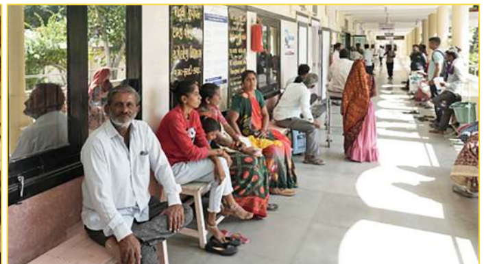
Glimpses of SBST Campus & Facilities