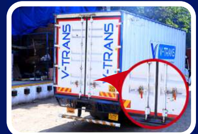
Secure lock-and-key system for the safety of your goods