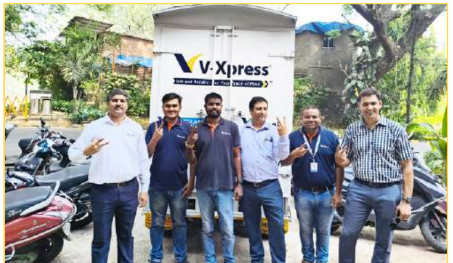
Campus Connect Highlights – IIM Mumbai