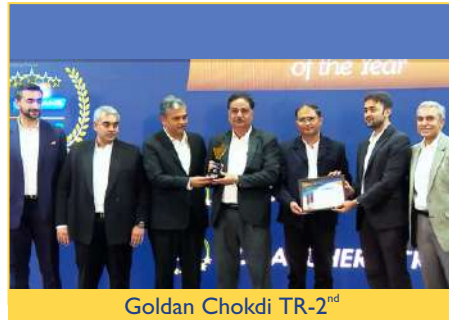
Goldan Chokdi TR-2 nd