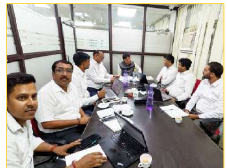
Our CMD at the North Regional Office – Team Interaction