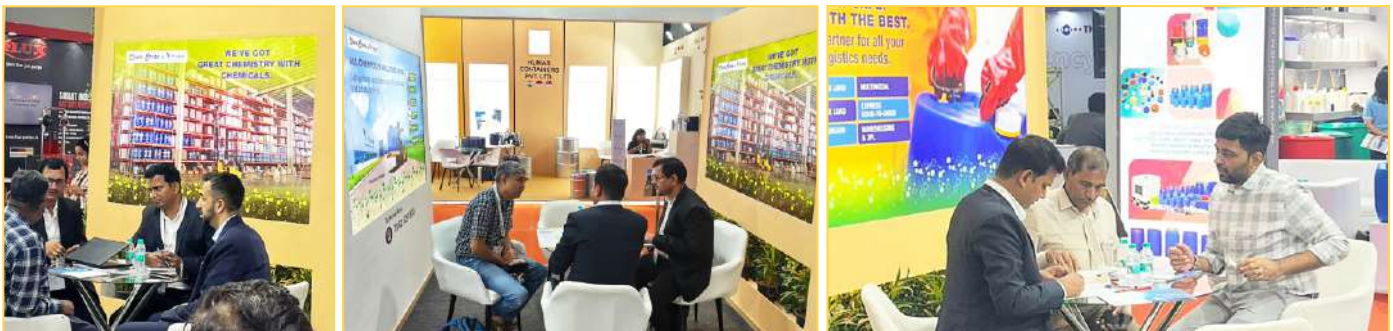
Team Interaction with Visitors at Stall