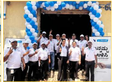
Rajaji Nagar Branch