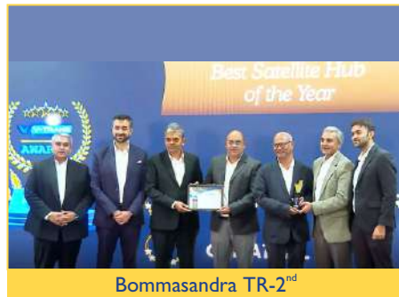
Bommasandra TR-2 nd