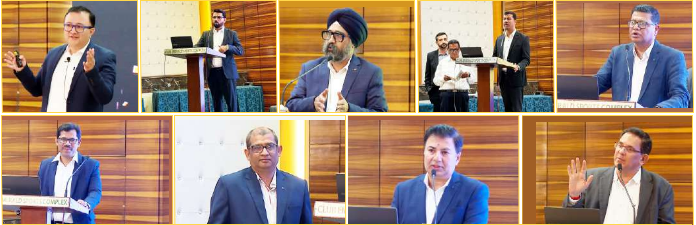
Corporate Leadership Connecting with audience