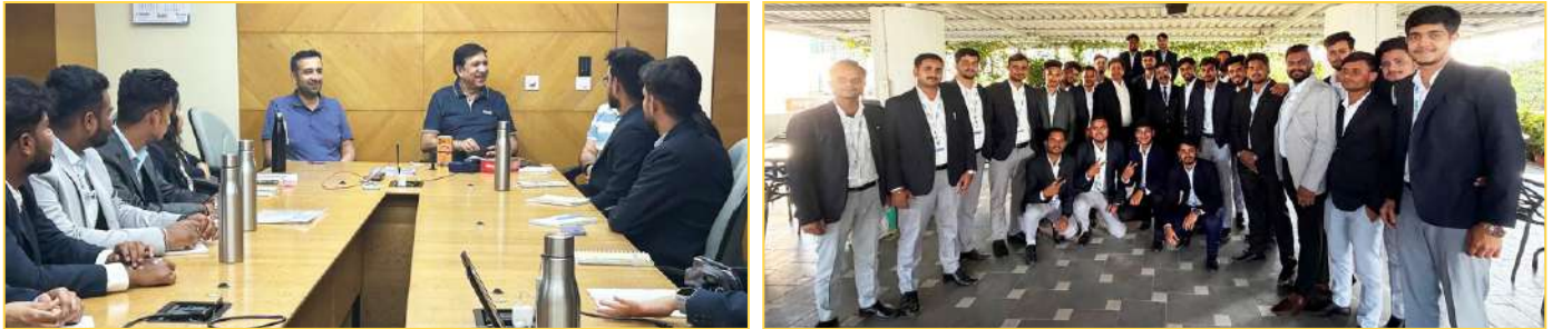
Moments with Senior leadership