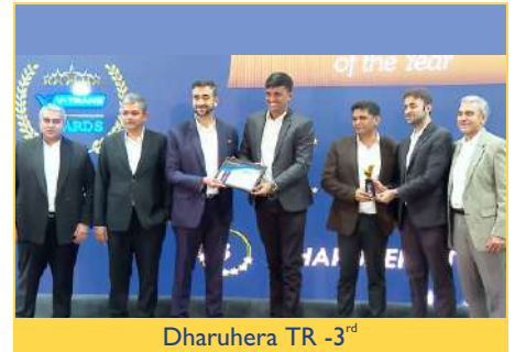
Dharuhera TR-3 rd