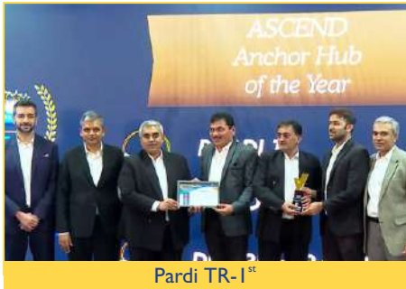
Pardi TR-1 st