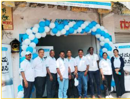
Deepanjali Nagar Branch