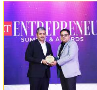
ET Entrepreneur Award 2026