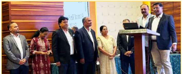
Zonal Managers addressing the audience