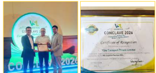
Awards Event Highlights

We are proud to share that V-Trans (India) Ltd. has been recognized among the Top 10 Prime Transporters at the Partner Meet organized by Vikram Solar. Additionally, we were honoured with a Certificate of Excellence from MCPI Pvt. Ltd. This acknowledgment reinforces our commitment as a trusted logistics partner and reflects the strong relationships we have built with our customers. Such milestones inspire us to further strengthen our service excellence and continue delivering value across every journey.