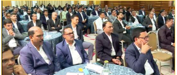
Management & Key leadership team at ASCEND-2026