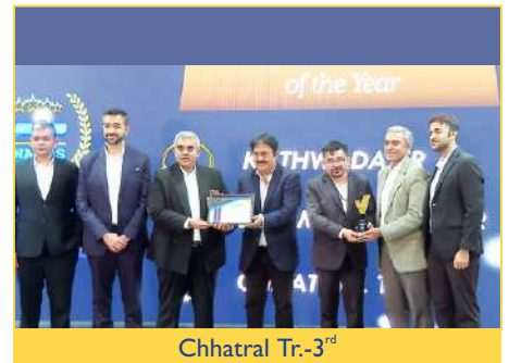
Chhatral Tr.-3 rd