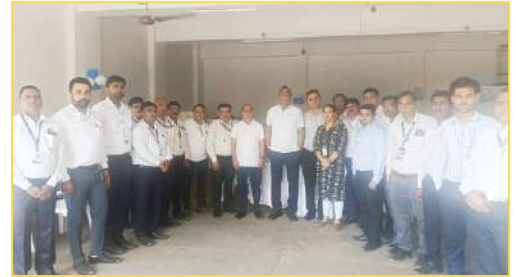
Highlights from Ahmedabad Region

The initiatives witnessed active participation from Regional Managers, Seniors and Regional Sales Teams, along with strong support from the HO team, resulting in meaningful customer conversations, improved visibility, and strengthened brand presence at the local level.