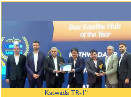
Katwada TR-1 st