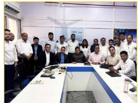
Our CMD visited our North Hub centres and interacted with all partners, where he was warmly welcomed by the partners