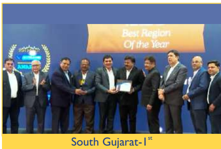
South Gujarat-1 st