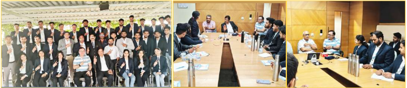
Group Snapshot and Interaction with Senior Management