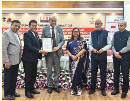
Our Senior Management While Honouring Excellence

This achievement further strengthens our resolve to uphold the highest standards of integrity across all our operations.